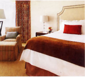
Four Seasons Hotel Vancouver

Of course, to enjoy waking up this way you'll need to book a room at the Four Seasons Hotel Vancouver in British Columbia—and not just any room.