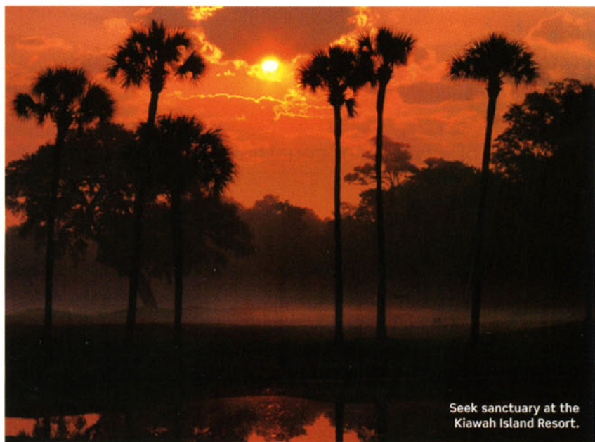
Seek sanctuary at the Kiawah Island Resort.