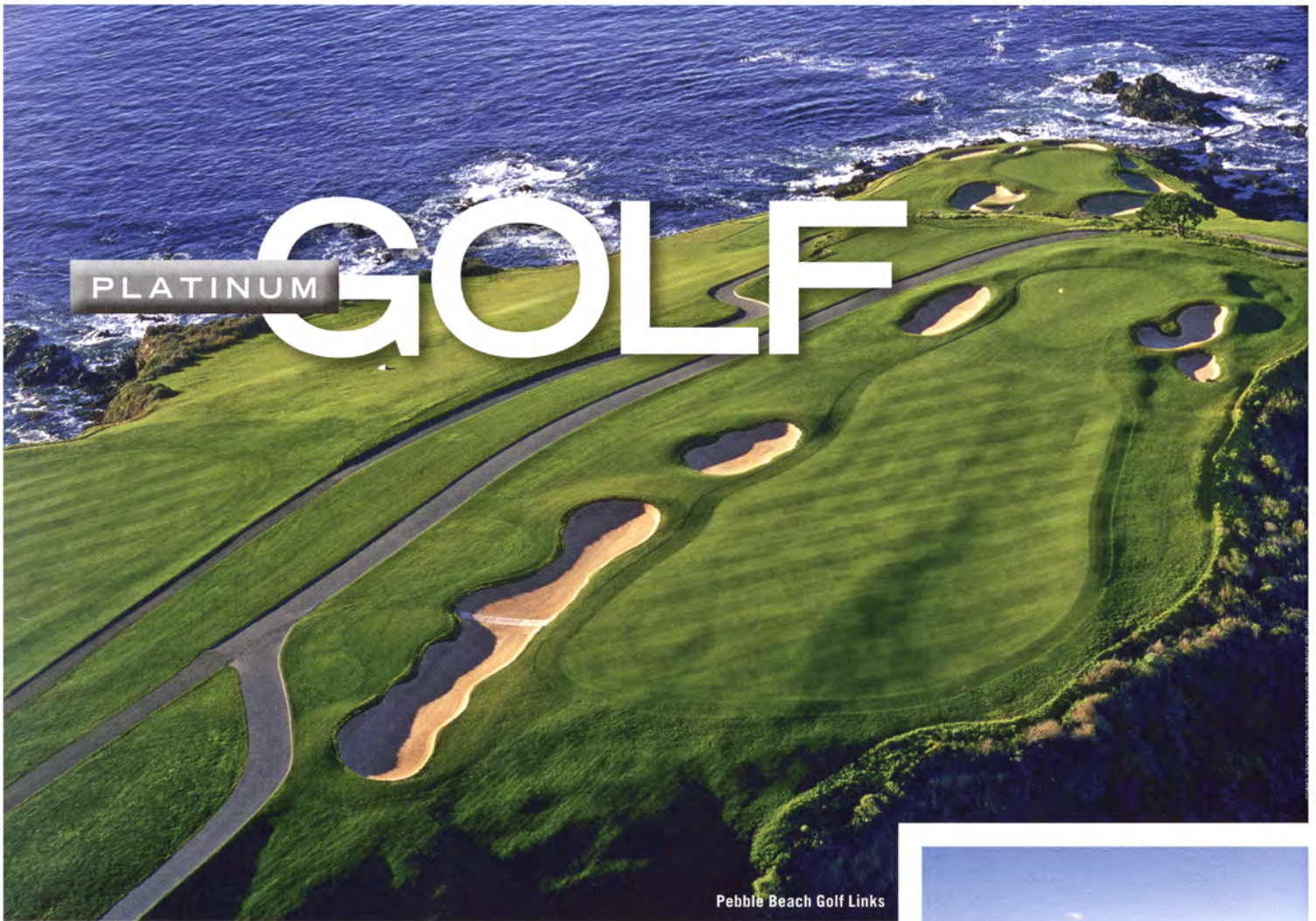
Pebble Beach Golf Links

Water settings never hurt. Put a golf course near an ocean, sea, bay, lake, or firth and the appeal factor rises. Perch it on a cliff, still better. Unavailable? Call in the mountain ranges to surround the course. To complete the package, add compelling design, expert conditioning, and customer service as well as a top-notch resort experience as the glittering ribbon to tie it all together.