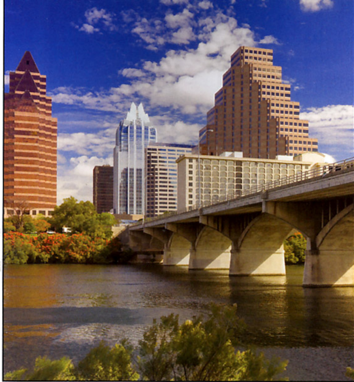
Congress Bridge in downtown Austin is the site of the largest urban bat colony in North America. At sunset, huge groups of bats take flight to search for food.

An Owner's Club at Barton Creek offers three-bedroom homes on the property with preferred treatment such as grocery shopping and concierge-arranged tee times and appointments. Other activities arranged by the concierge for Barton Creek guests include limousine trips to watch tango