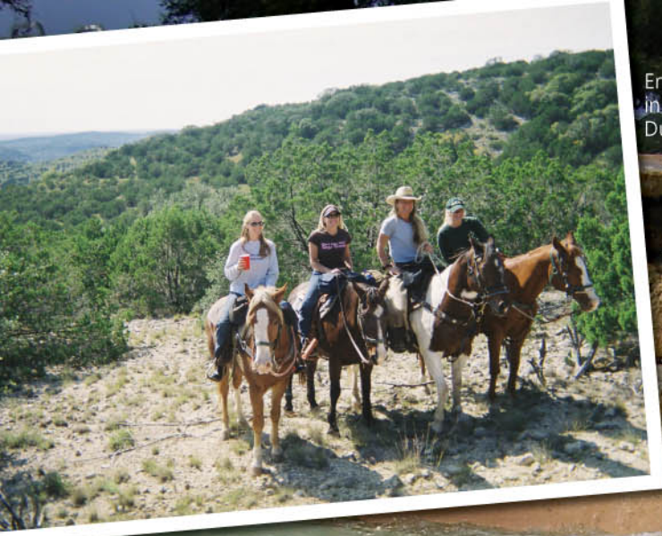
Enjoy a trail ride (left) or a lazy tube float in the lagoon (below) at the Flying L Dude Ranch Resort in Bandera.